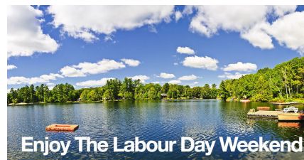
Enjoy The Labour Day Weekend

The Shaar Hashomayim Office is CLOSED this Monday, September 5 th , 2022 for Labour Day .