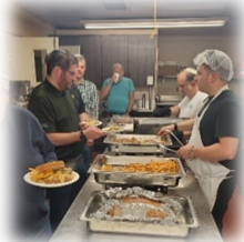
Breakfast is served: Meat & Egg Scramble, Fries and Bread