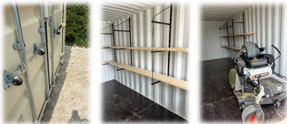
New Storage Container and Zero-Turn Mower at the Shaar Hashomayim Cemetery