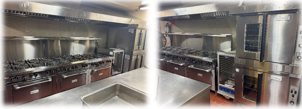
New Appliances in Meat (Fleishig) Kitchen