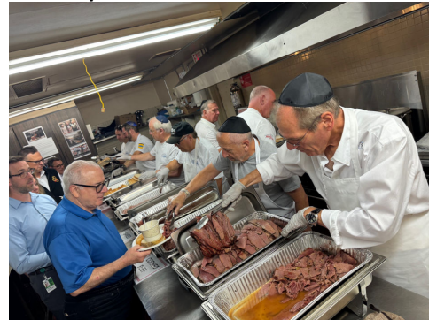
Servin' the Meat.