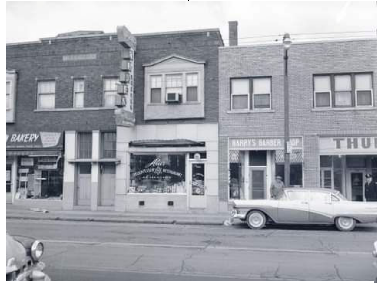
Adler's Bakery and Abie's Deli on the 500 block of Wyandotte Street East, date unknown.